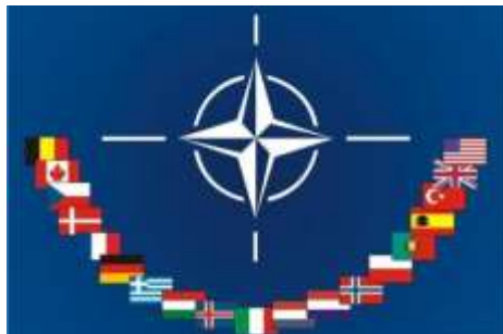
SUMMARY OF THE NATIONAL REPORTS OF NATO MEMBER AND PARTNER NATIONS 2014